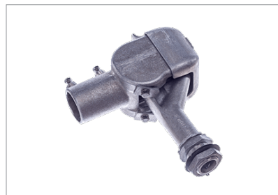
Rubber Cushioned Mast Arm Hanger