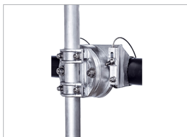
CAN- BRAC Universal Signal Assembly