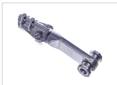
Adjustable Offset Plumbizer